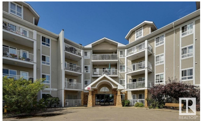
328-5350 199 St NW, Edmonton, AB