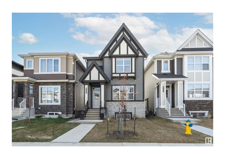
B149 226A St NW, Edmonton, AE